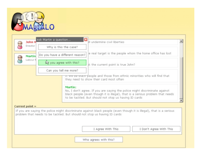
Figure 2. Dialogical interaction in MAgtALO

acts [7] or performatives and that when uttered they have the characteristics of actions. In a dialogue game the kinds of moves that can be made, and hence the kinds of things that can be said correspond to particular speech acts. For example, the influential game, 'DC' due to Mackenzie [4] includes the statement, withdrawal, question, challenge, and resolution demand performatives. In addition to the performatives, dialogue games are commitment based meaning that when a participant makes a move it affects their commitment with respect to the content of that move. For example, in DC uttering a statement causes the speaker to become committed with respect to that statement. Dialogue games also specify a protocol for how a dialogue can legally develop, for example, specifying that after a question, the next move must be an either a statement or withdrawal. Dialogue games have been used to analyse various errors in reasoning such as the fallacy of begging the question [4] and as normative ideals for discourse in specific domains such as ethical discussion [8]. A fragment of the dialogue game protocol can be seen in figure 2 in which the user is asking the agent Martin a question. In response to the current point, the user is able to ask Martin to supply a reason for the current point, or to supply further reasons if the proffered reason is not sufficient, or Martin can be asked whether he agrees or whether he can expand on his current position.